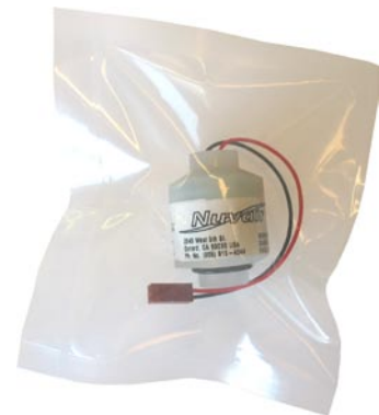
Sensor Sealed in Bag

To extend Sensor life, the Analyzer is supplied with the Sensor sealed in a bag. When first received, please verify that the bag is intact. If it is torn, contact your supplier for assistance. Prior to initial use, install the Sensor into the Analyzer in accordance with the Sensor Replacement procedure. It is not necessary to remove the Sensor between Analyzer uses.